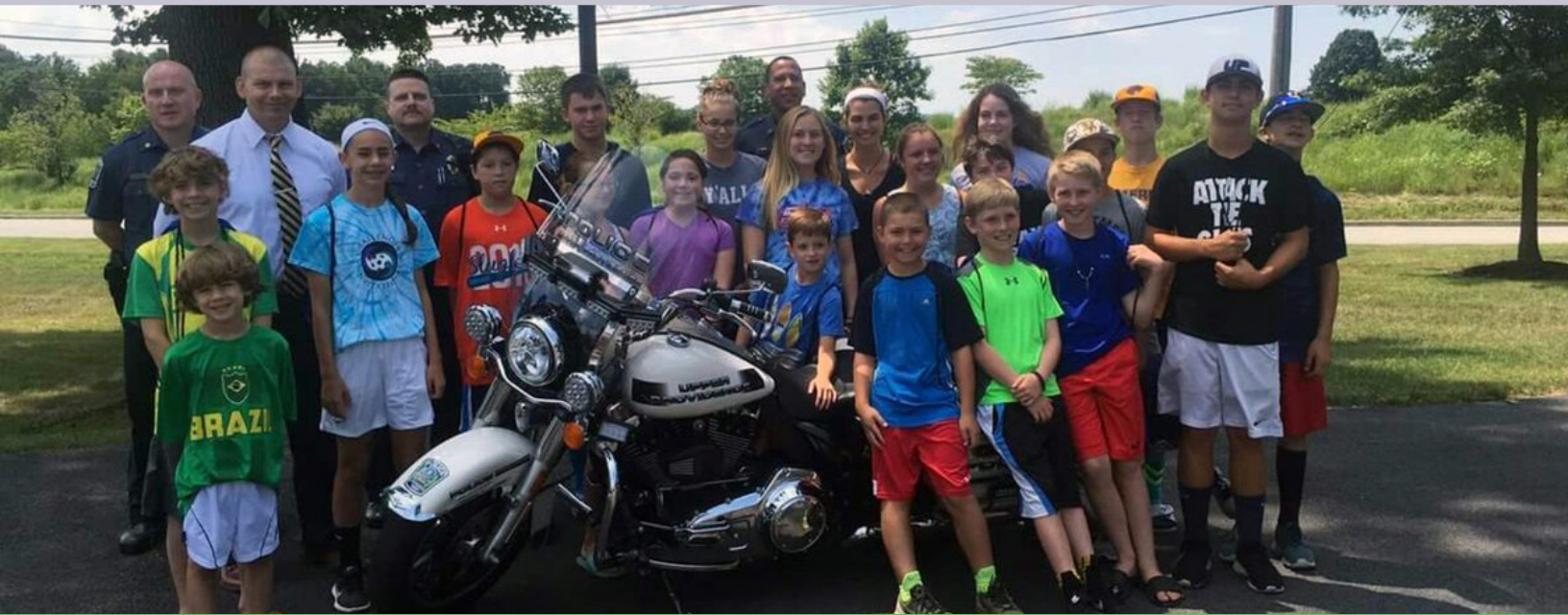
Rivercrest neighborhood kids pose with police officers after they stopped at the precinct to show the officers their support. The neighbors brought the officers cookies and snacks to show their gratitude.

As you read this newsletter, you may have noticed an updated contemporary and vibrant design and new Township Seal. The updated look and feel of this publication is one of the many changes that has been a part of the exciting Township of Upper Providence rebranding project.