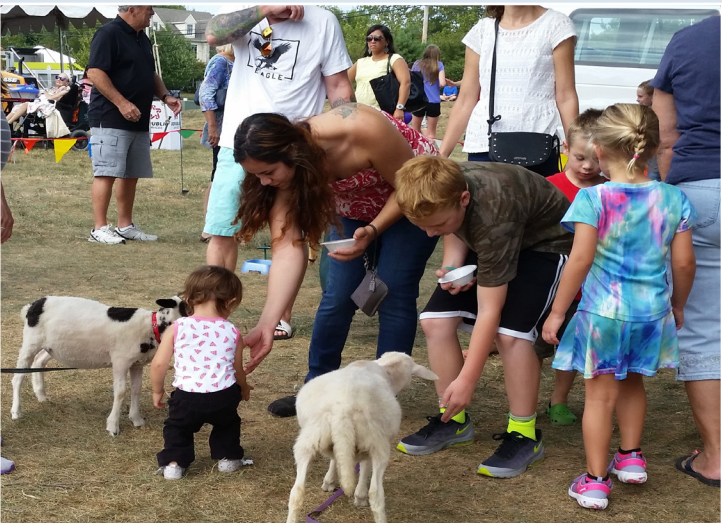
Community Day 2016 Petting Zoo

Want even more details and behind-the-scenes photos of Community Day? Like our Upper Providence Township Community Day Facebook page at: www.facebook.com/UPTCommunityDay