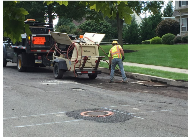
Milling crew milling the roadway.

The paving work was bid in two phases totaling over $2 million, all of which will be paid from non-debt instruments, stated Broadbelt. "We expect all work will be done before the winter season commences." ❖