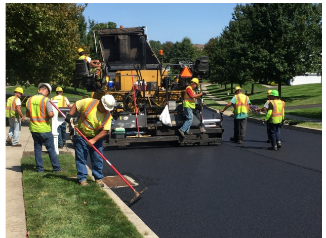
Paving crew paving the roadway.