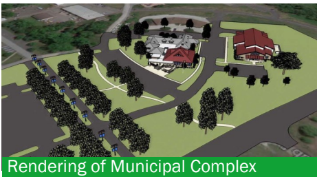
Rendering of Municipal Complex

The new facility will also include a new township meeting room, which will be used for not only township functions but community-wide functions and regional forums as well. A large component of this project includes major infrastructure improvements to Black Rock Park, most notably an expanded parking