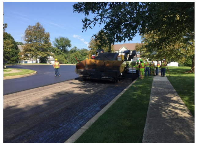
Paving crew paving the roadway.