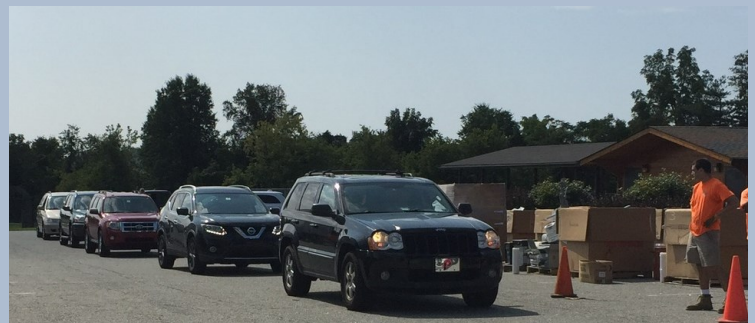
Cars line up to recycle electronics at the August 26th Event.

August 26th's Electronic Recycling Event collected a total of 26,604 pounds of materials! 3,594 lbs. of microwaves, 13,501 lbs. of televisions, 6,209 lbs. of printers and scanners, 752 lbs. of electronic waste, 2,198 lbs. of PCs and 350 lbs. of wires were collected at the event. Thank you to all who came out and recycled their electronics!