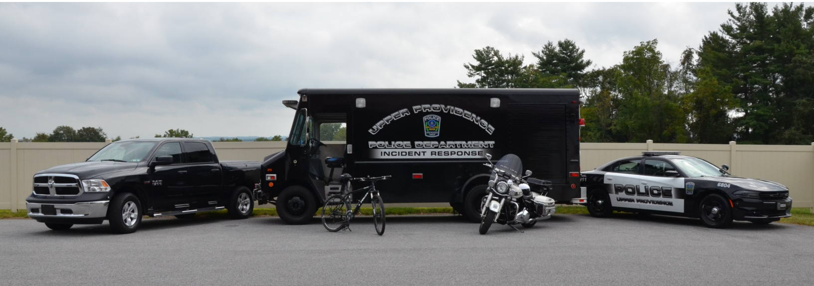
Upper Providence Township Police Vehicles during Accreditation

When the Board of Supervisors updated its strategic plan in 2017, it reaffirmed once again its core goal of providing Upper Providence residents and businesses with the best and highest quality police services in the region. Saying this and doing what was required to attain this high service quality was not easy and required several arduous years to achieve the holy grail in police services: Obtaining official recognition as an accredited Police Department.