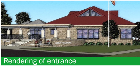
Rendering of entrance

No doubt if you have traveled to Black Rock Park recently, you have noticed a substantial amount of earth moving activity. This will be the future site of a new and improved municipal services center that will soon offer one stop shopping opportunities to all residents and businesses.