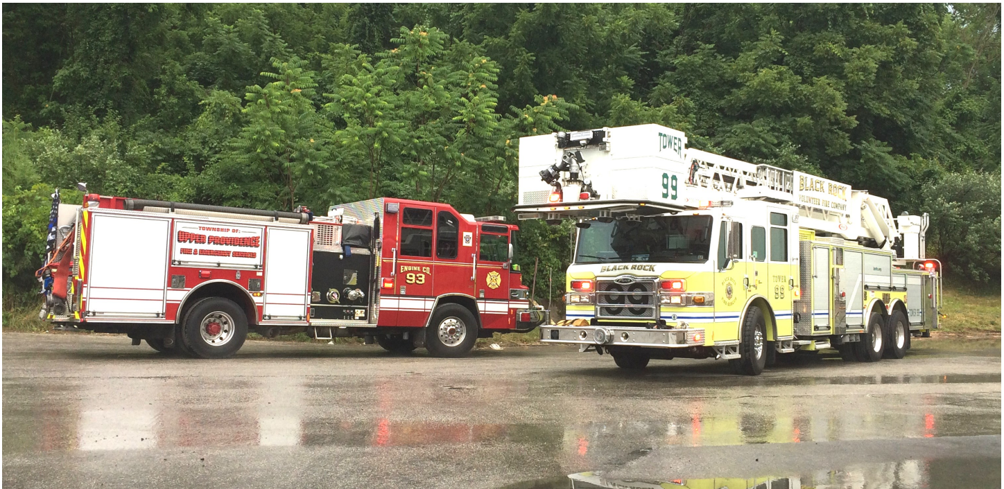
Upper Providence Fire Engine 93 and Black Rock Volunteer Fire Company Fire Tower 99.

The Board of Supervisors' first order of business was to handle some very complex and controversial issues centered around fire and ambulance (EMS) services in Upper Providence Township.