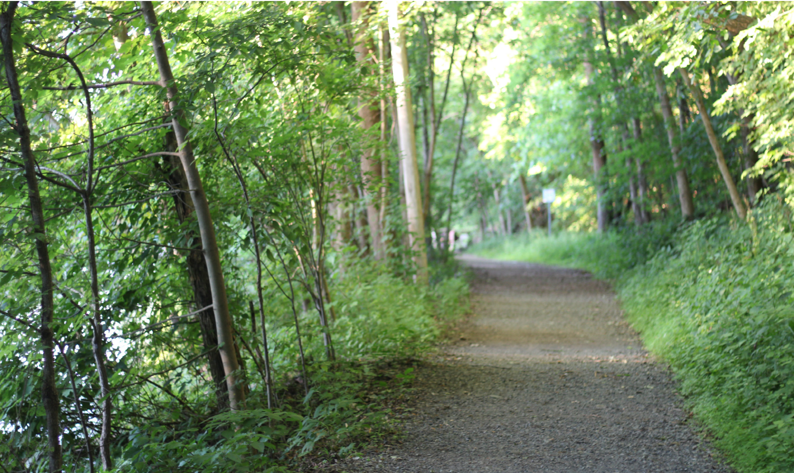
Trails in Upper Providence Township

As many of us find ourselves at home during this time of social distancing, you might find yourself getting restless, feeling anxious, or just needing a change of pace. Studies have shown that spending time outside in nature cannot only relieve stress and anxiety but also improve your mood and heart health. It is important to not only get outside, but also to take some time to decompress and disconnect from the buzz of life happening around us. The benefits of nature can be felt by all ages both young and old!